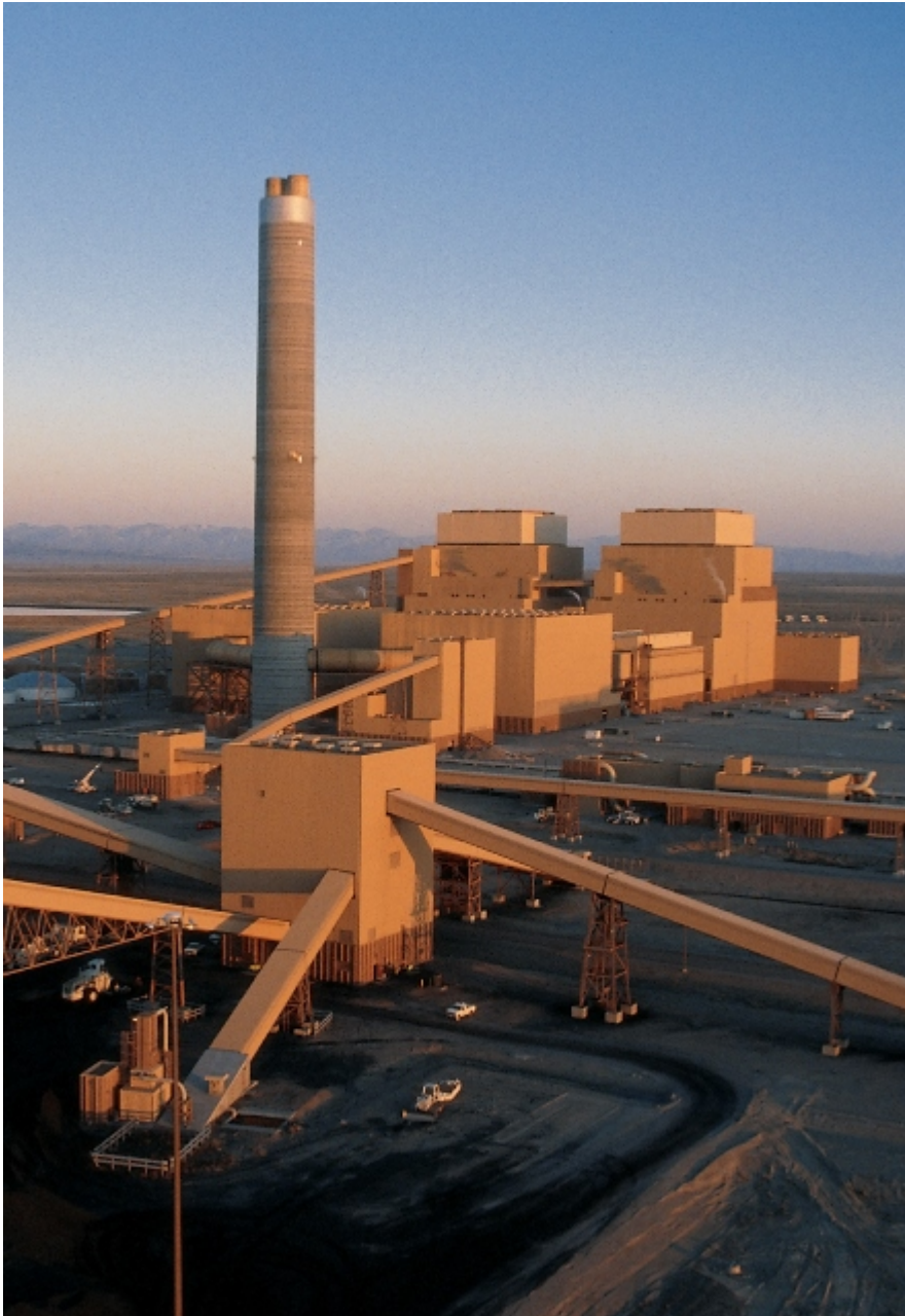
Intermountain Power Project.

One of the first concrete steps occurred in March, when the Intermountain Power Agency (IPA), which owns IPP, awarded Mitsubishi Hitachi Power Systems (MHPS) a contract for two advanced-class, combined-cycle natural gas turbines for IPP that will be capable of burning renewable hydrogen.